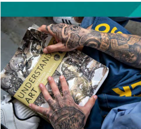
A PAC art student with a textbook at Calipatria State Prison.

California Department of Corrections: "Prison Arts Collective: Chapters, Research, and Training," $295,544 ; "Prison Arts Collective: Community-building through Transformative Arts," $61,167 ; "Prison Arts Collective: Facilitator Training Program," $73,091