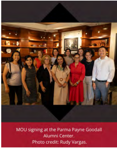
MOU signing at the Parma Payne Goodall Alumni Center.

Michigan College Access Network: "School Counselor Fellows and Professional Development," $60,000