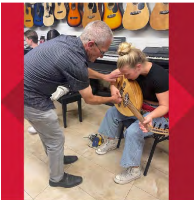
Middle Eastern Music Class, Arabic Project GO 2023.

Institute of International Education: "Language Training Center Defense Language Institute Foreign Language Center (DLIFLC) Special Initiative," $312,978 ; "SDSU-LARC National Language Training Center for DoD," $1,499,999 ; "Project GO: Language Acquisition Resource Center at San Diego State University," $469,993